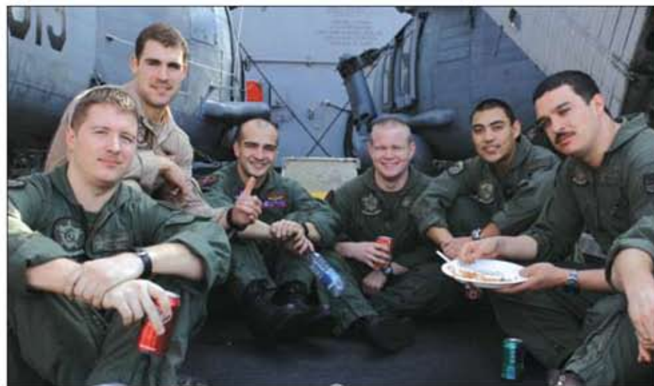
Some of the more than 5,000 U.S. troops aboard the USS Nimitz enjoying a holiday steak feast.