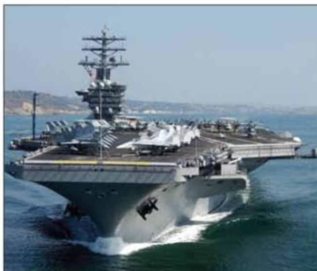
As of September 19, the USS Nimitz has flown more than 2,200 combat sorties, providing 30 percent of the close air support to the coalition forces in Afghanistan.

It will be interesting to see where the Steak Team Mission's next holiday will be. HN